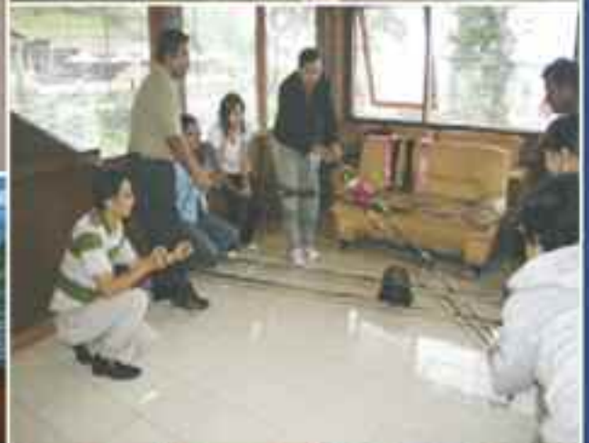
On 20 - 21 November 2009, Marketing Department in PTMAA held out-house training, called "Team Building". Many activities were held. At the end all the participants made a self commitment and imprinted their palms with rainbow colours.