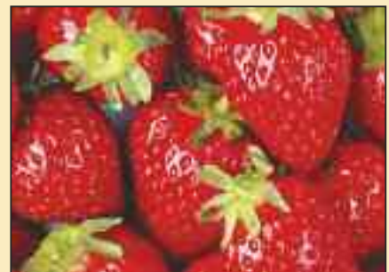
There is a museum in Belgium just for strawberries

the blood, liver and spleen. In parts of Bavaria, country folk still practice the annual rite each spring of tying small baskets of wild strawberries to the horns of their cattle as an offering to elves. They believe that the elves are fond of the fruit and will help to produce healthy calves.