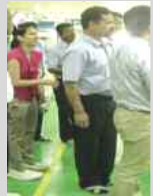
Delegates from Kawasaki visited MCL Security Systems Pune Unit on 18th Nov 2009. The visiting team interacted with the employees and showed keen interest while on the plant visit.