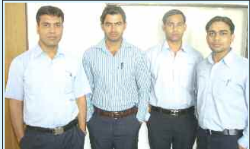
The new technology team- MCL, Noida

television. Landing would not have been possible without it.