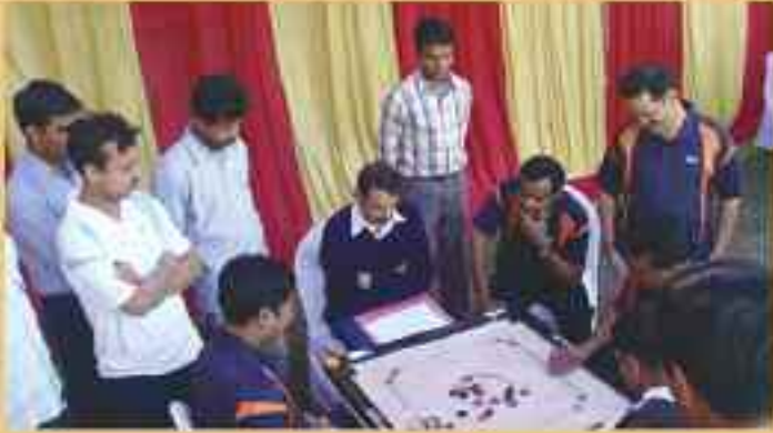
STRIKING TOP SLOT