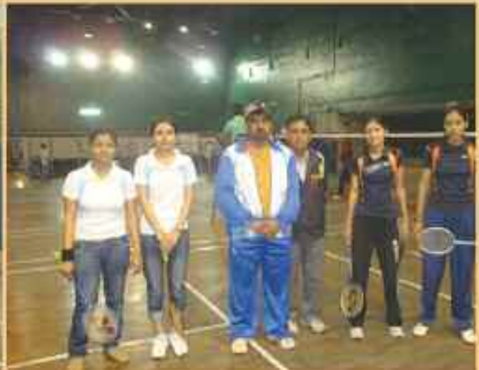
WINNERS TAKE IT ALL: FINALIST OF THE BADMINTON SINGLES AND DOUBLES MATCHES