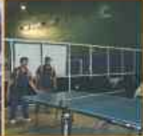
ITS NOW TIME FOR INDOOR GAMES: CARROM AND TABLE TENNIS