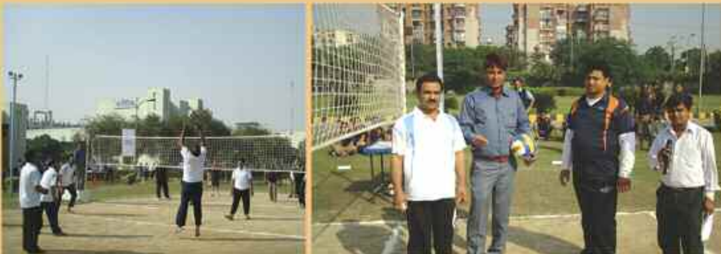
ITS VOLLEYBALL TIME FOLKS!!!