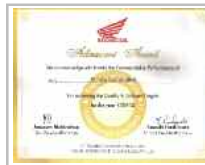
Minda SAI- Greater Noida was given the achievement award by HONDA MOTORCYCLE and SCOOTER INDIA LTD for quality and for ON-Time delivery in the year 2009-10 CONGRATS!!!