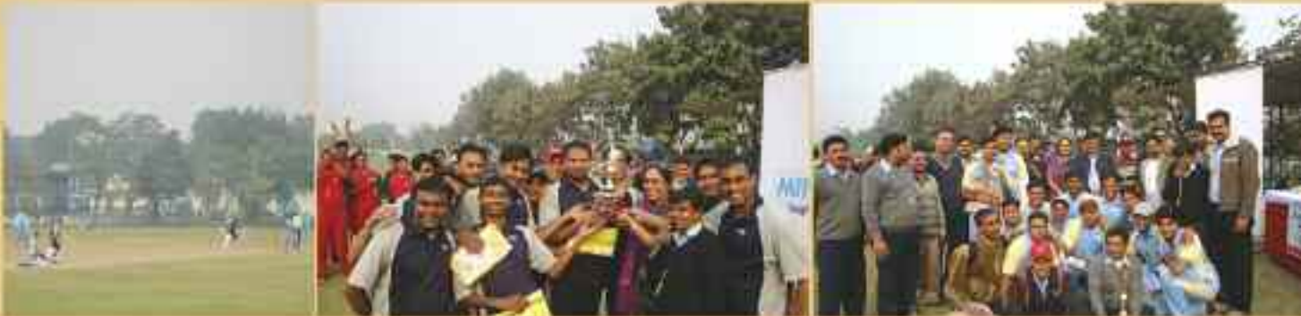
ENGROSSING GAME: The final cricket match in progress, Runners up MCL-NOIDA and winners Minda SAI.